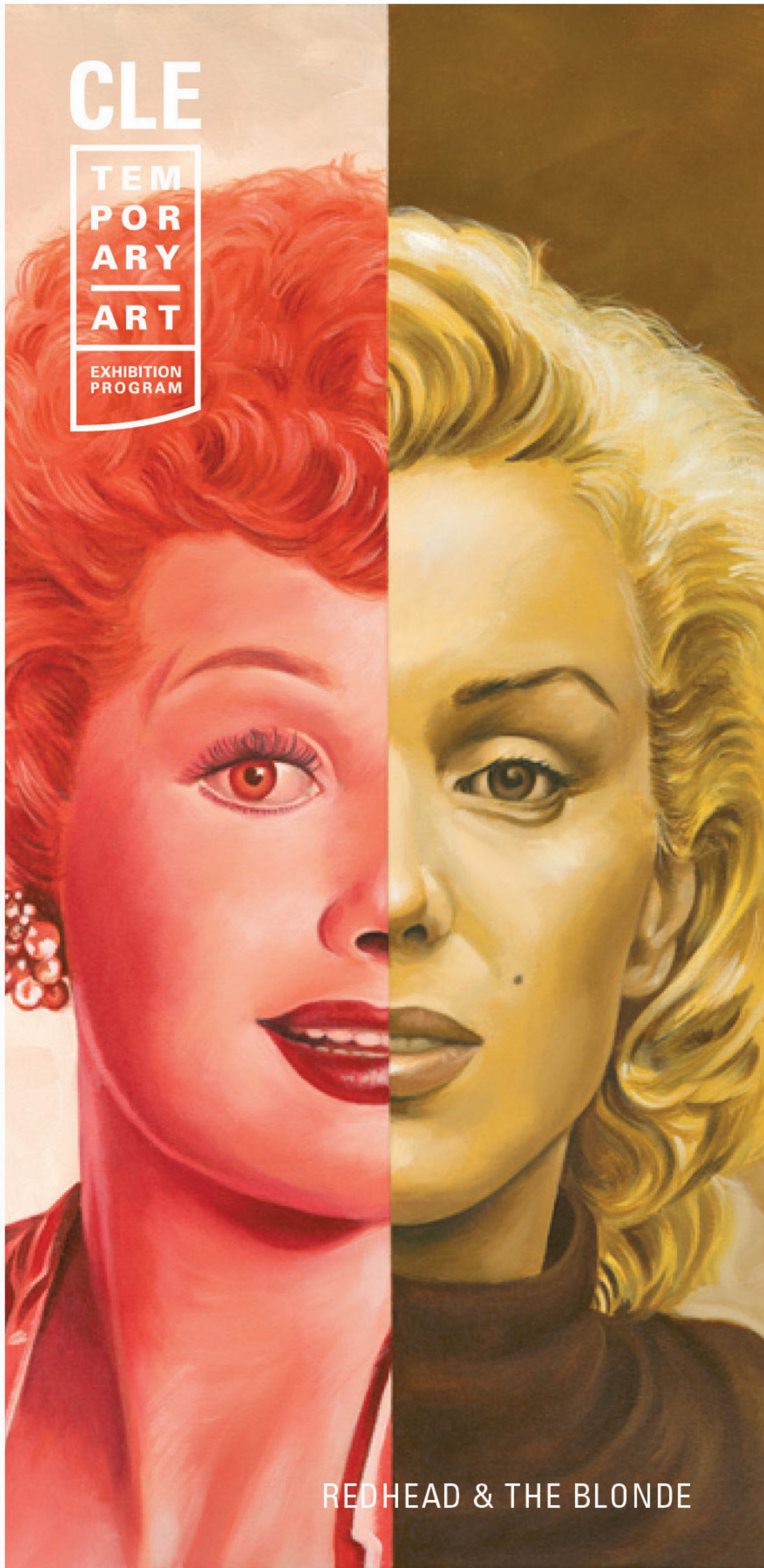
REDHEAD & THE BLONDE